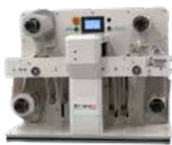
Arrow EZCut 240