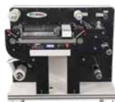
Arrow EZCut 330R