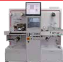
ArrowCut Nova 250R