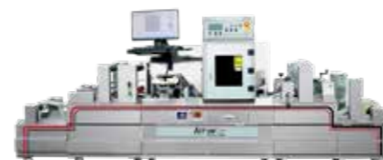
ArrowCut Nova 330R