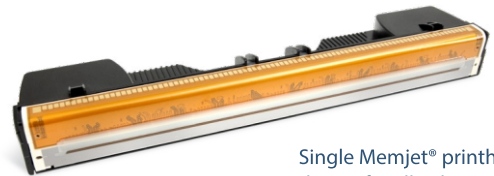
Single Memjet® printhead design for all colors CMYK

Seamlessly merge designs and layouts with text, images, barcodes and database information to handle the needs of security packaging, tracking, personalization and micro-segmentation.