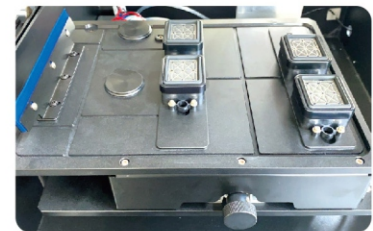
Automatic moisturizing cleaning system+ large blade cleaning system, high cleaning efficiency, cleaner, and ensuring cleaning stability