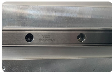
THK high-precision silent guide-rail, printing is quieter and printing quality is guaranteed