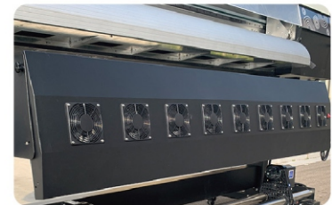
Standard intelligent infrared heating system to ensure instant drying when printing