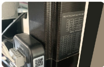
High-quality DC servo motor, good stability and long service life